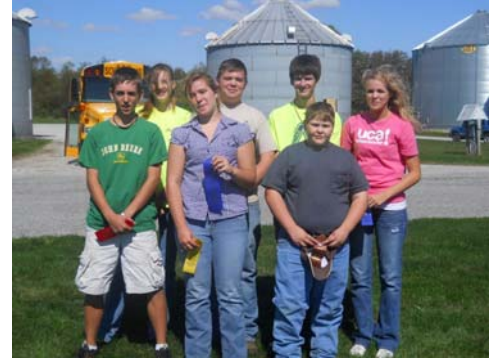
First Place Nokomis Team